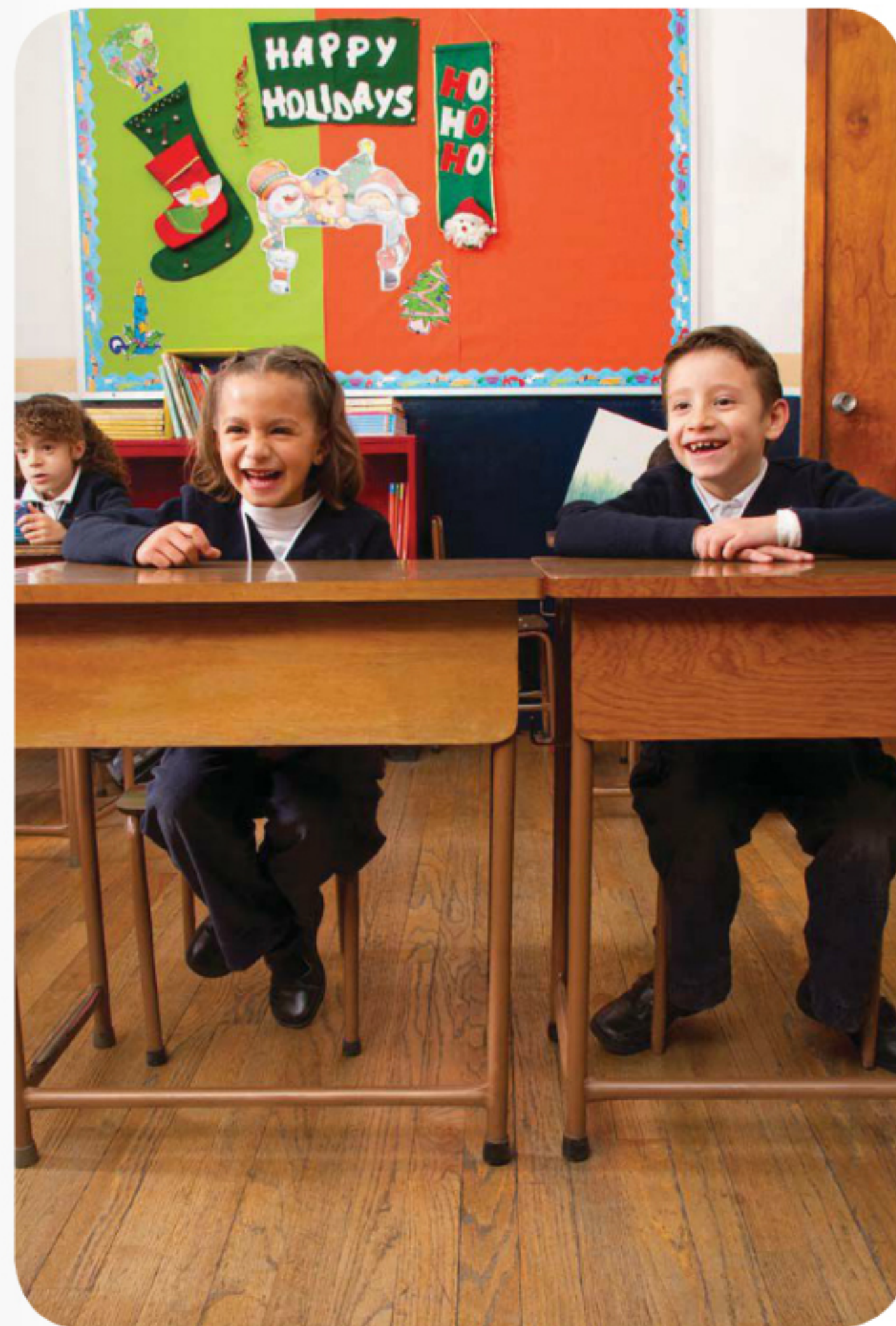
They are happy.